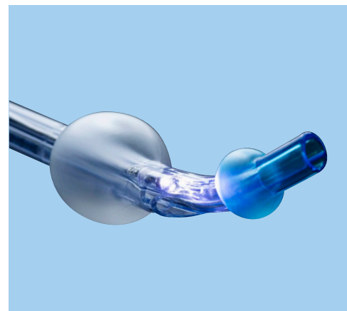
Ambu® VivaSight™ 2 DLT.