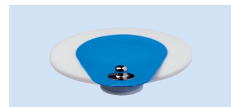
S = Stud