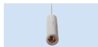
F = 3 mm connector