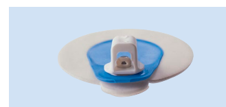
F = 3 mm connector