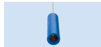
A = 4 mm connector