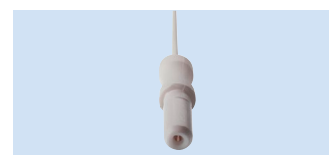
K = 1.5 mm connector