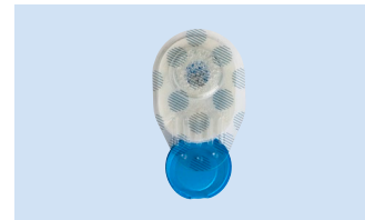
Printed release liner