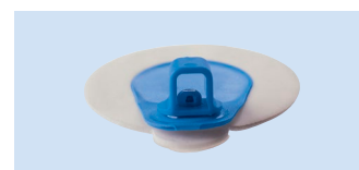
A = 4 mm connector