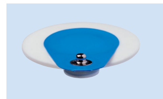
S = Stud