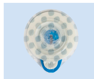
Printed release liner