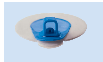
A = 4 mm fitting