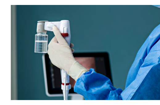
Switch between suctioning and sampling at the turn of a knob